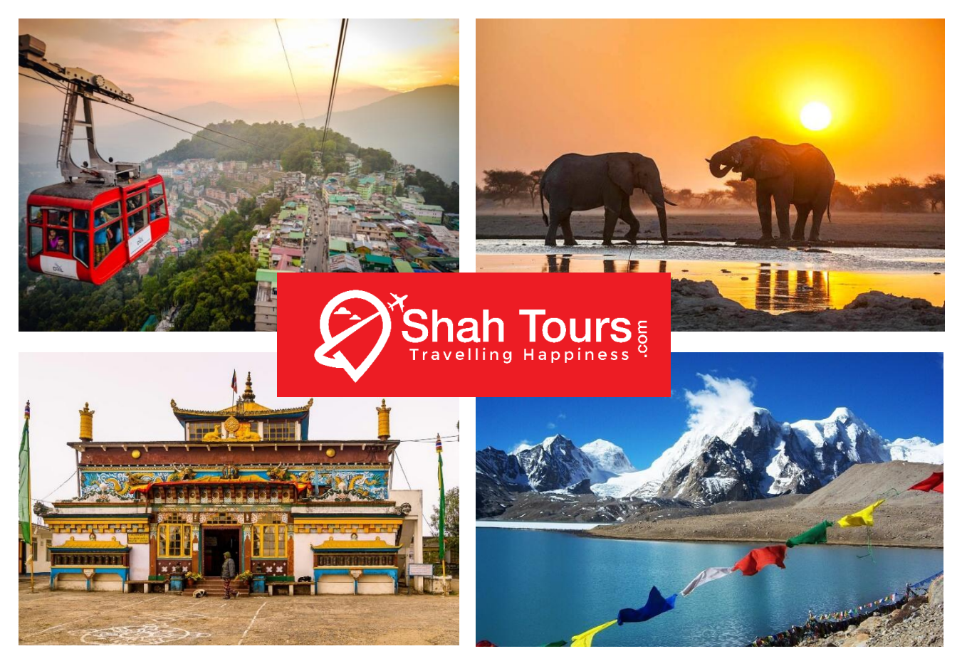
Experience beautiful tourist spots specially curated in our packages to enhance your travel