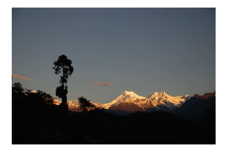
During clear sunny days – tourists can witness